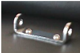
Figure 2 (U-clamp)