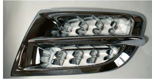
45-1629NUA Right Side