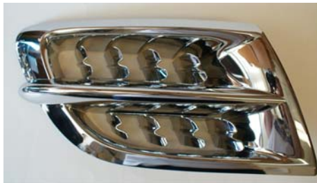
45-1629NUA Left Side