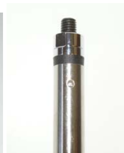
Black Allen Stud